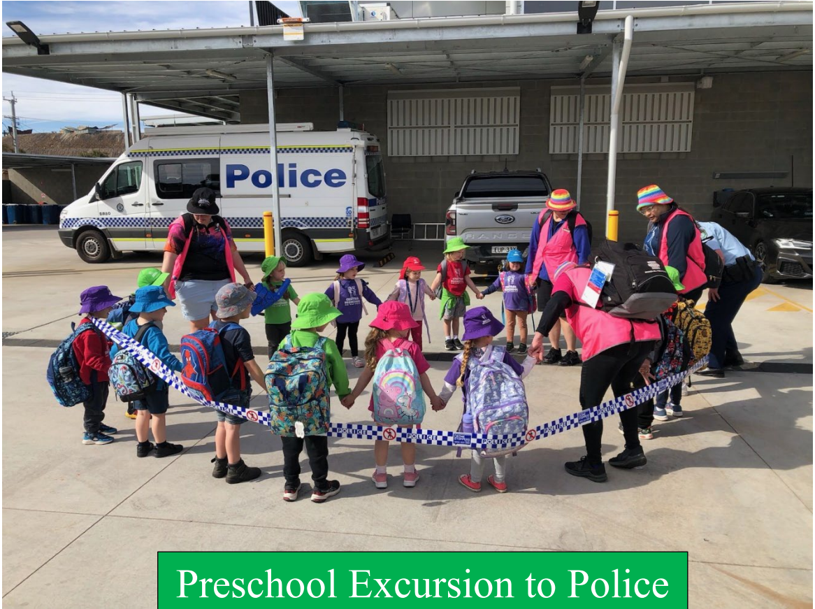
Preschool Excursion to Police Station and Fire Department